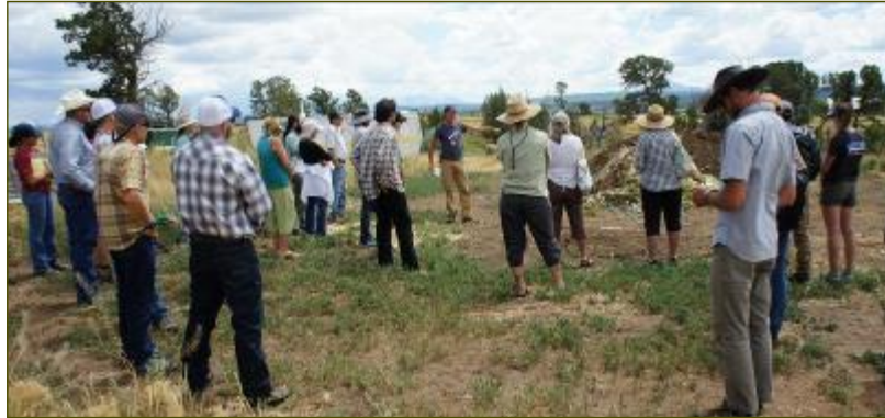
Compost Seminar participants listen as Tony Daranyi shares the compost method utilized at Indian Ridge Farm during Field Tour on Aug. 1, 2023.

NRCS CSP Funding Opportunity, Applications Due Aug. 18 9